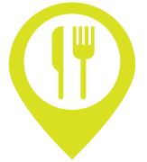
Free School Meals and Uniform Allowance

If parents/guardians have difficulty in obtaining a Proof of Benefit Letter, or do not understand how to provide evidence of their Universal Credit or Tax Credits, their local Social Security Agency office Digital Hub will have staff on hand to help them obtain the correct evidence to support their application.